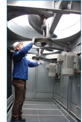
Fan drive system easily accessible while standing