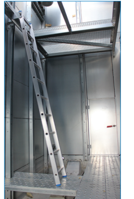
Inward swinging access door leading into a spacious plenum