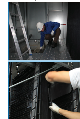
Patented BACross fill for sheet by sheet inspection and cleaning