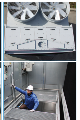
Internal service platforms*